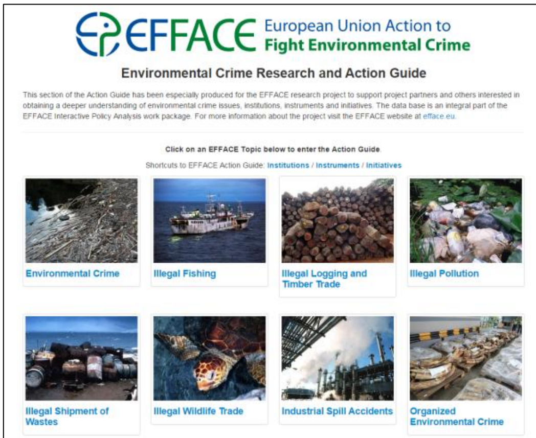
Figure 2: Screenshot of EFFACE Environmental Crime Research and Action Guide

The Action Guide currently covers the following topics: